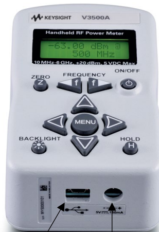
Figure 1. Signal connection

USB type Mini-B port for connection to PC