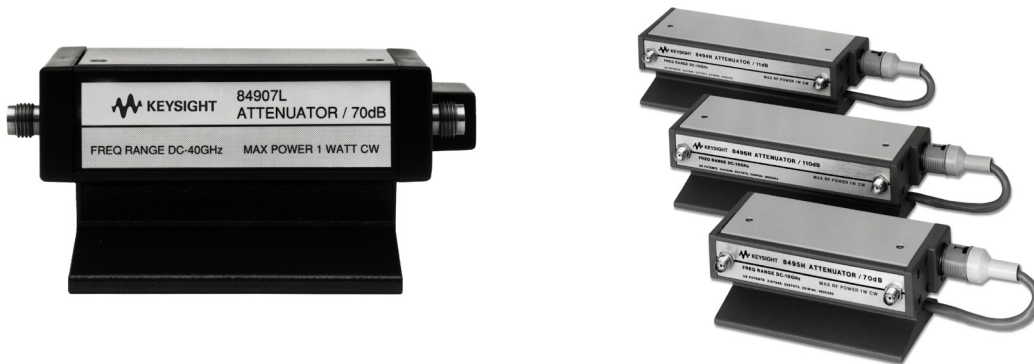
Figure 4. Programmable step attenuators.

Keysight programmable step attenuators offer fast, precise signal-level control up to 50 GHz, with switching time of less than 20 ms. Unmatched attenuation repeatability of less than 0.03 dB up to 5 million cycles per section ensures low measurement uncertainty and reduces calibration cycles when installed into test systems. Automatic GPIB/USB/LAN drive control is achieved with the 11713B/C attenuator/switch driver.