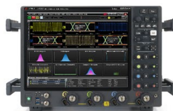
3.5 mm input models