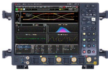
1 mm input models

The UXR is available in three models based on bandwidth, sample rate and input connector size. Infiniium UXR-Series models offer bandwidths from 5 GHz to 110 GHz with various 1-channel, 2-channel, or 4-channel configurations available. The 3.5mm models are equipped with Keysight AutoProbe II interfaces while 1mm and 1.85 mm models incorporate an advanced high-performance high-bandwidth Keysight AutoProbe III interface.