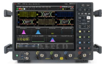
3.5 mm input models