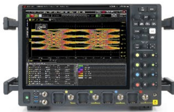
1.85 mm input models